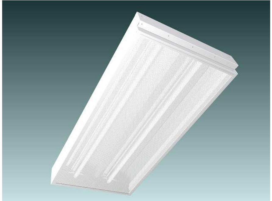
LS-9RM (600mm x 1200mm)

Housing constructed from 22 gauge pre-painted white steel. Hinged door frame built from 20 gauge steel powder-coated after fabrication. K12 Acrylic lens is used to refract light evenly to prevent glaring. Quick access plate permits ease of installation.