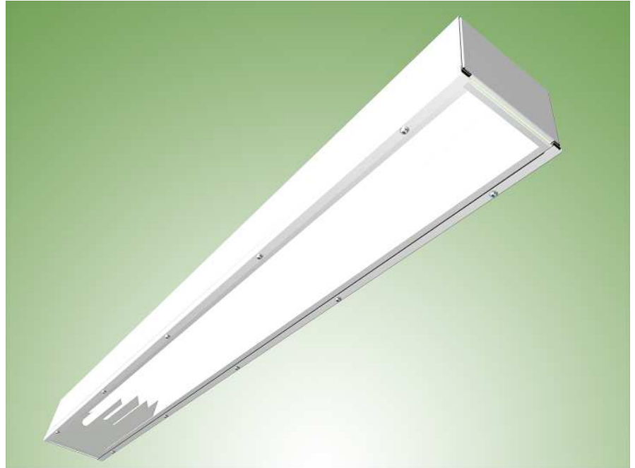
LS-T5HO-OSB (1 Lamp)

Housing constructed from 20 gauge post-painted steel. A gasketed clear Lexan or acrylic lens shields the reflector and lamps. An optional wall mounting kit is available.