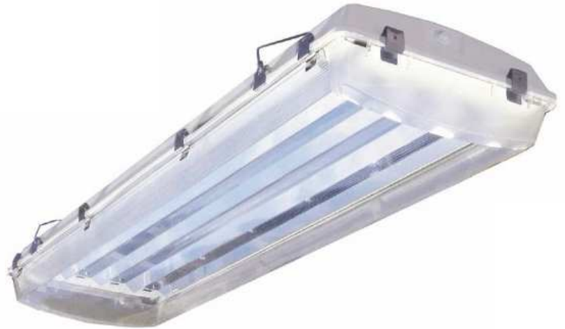
CL-4-VAP (6 Lamp)