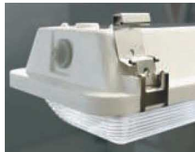
Stainless Steel Latch