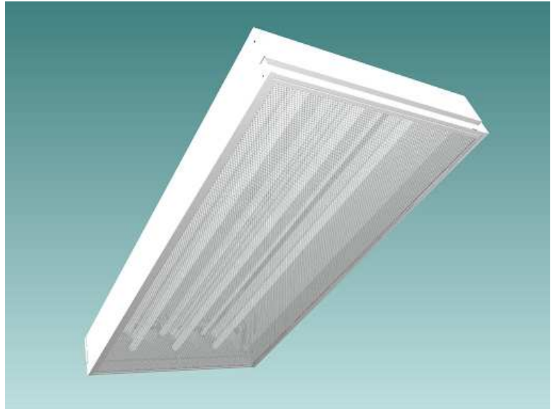
CL9R (3 Lamp T8)

Housing built from 20 gauge pre-painted white steel. Hinged door frame built from 18 gauge steel powder-coated after fabrication. K12 Acrylic lens helps refract light evenly to prevent glaring. Quick access plate permits ease of installation.