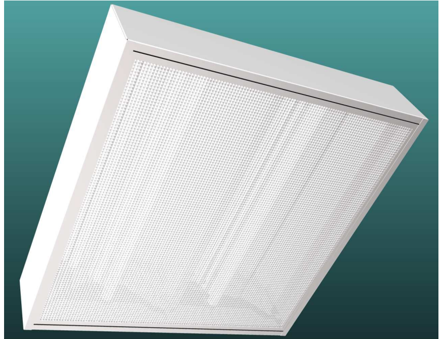
LS-HCB (2 Lamp T8)

Housing and hinged door frame constructed from 20 gauge steel powder-coated after fabrication. Acrylic lens is used to refract light evenly to prevent glaring.