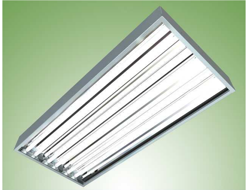
CL-HIBS-GLV (6 Lamp)

Designed for surface or chain-mounting applications.