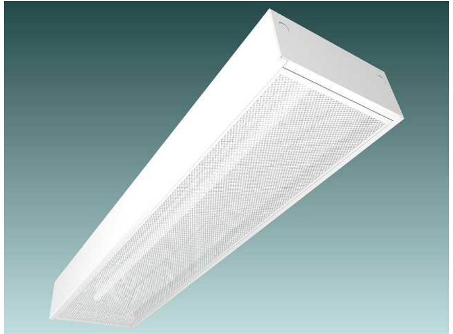
LS-9S (1 Lamp)

Housing and hinged door frame constructed from 20 gauge steel powder coated after fabrication. K12 Acrylic lens is used to refract light evenly to prevent glaring. Quick access plate permits ease of installation.